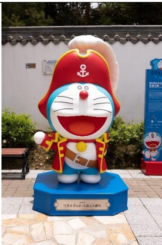
"Doraemon: Nobita's Treasure Island" (2018)