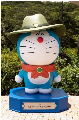
“Doraemon: Nobita's New Dinosaur” (2020)