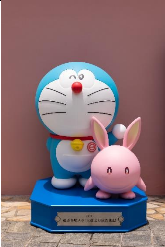
“Doraemon: Nobita's Chronicle of the Moon Exploration” (2019)