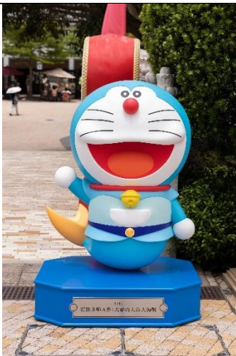
"Doraemon: Nobita's Great Battle of the Mermaid King" (2010)