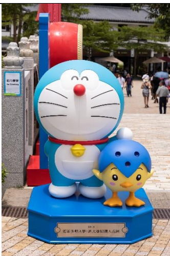
"Doraemon: Nobita and the New Steel Troops—Winged Angels" (2011)