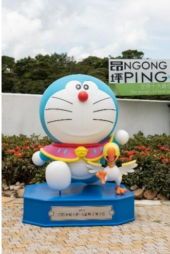
"Doraemon Movie : Nobita Aur Jadoo Tapu" (2012)