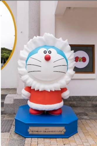
"Doraemon: Great Adventure in the Antarctic Kachi Kochi" (2017)