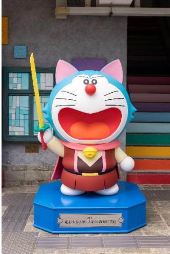
"Doraemon: Nobita in the Wan-Nyan Spacetime Odyssey" (2004)